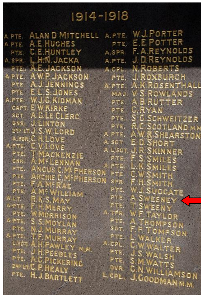
Manly ANZAC War Memorial